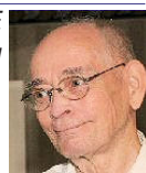
Photo imaging editors have proven their place not only with their importance with cropping, sizing, limited error correcting, and preparation for albums but also to participate as a part of a storybook with emotion.

Spike Smith, NCE harold.smith@ntpcug.org